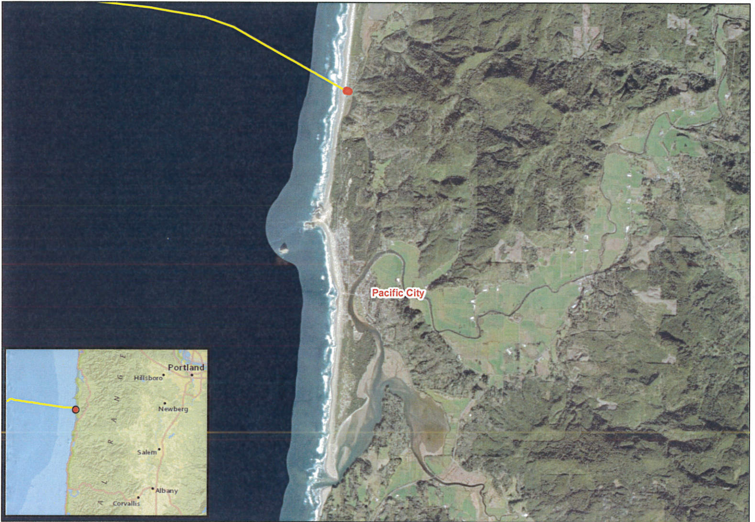
Figure 1: General Location Map Pacific City Oregon Jupiter Submarine Cable System